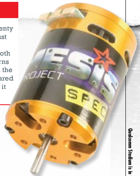
Outdoor Stadium is in San Diego and I'm sure this truck would fit in like.

The Team Epic Nemesis 10.5 BL Motor is a perfect match to the RT5 truck, with plenty of torque and rpm. Most of my friends know that I have one solid "blow out" in just about every 5-minute race, but this has nothing to do with the power on hand. In fact, the power would often help me out of some sticky situations since it came on smooth and strong when needed. Brakes were strong and helped me negotiate some quick turns and the torque really helped when flying in the air. With timing manually adjustable in the motor, combined with ESC timing, there is a big range of power that can be used if geared correctly. For most racers, having this kind of power is probably overkill, but watching it fly out of every corner without any weird side effects is just plain fun.