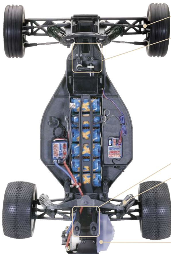
Photo shows optional items not included in all kits